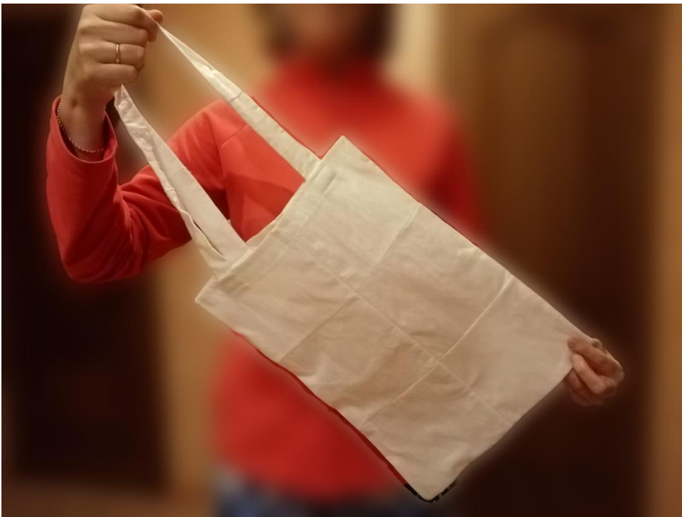
Picture 7. My shopper