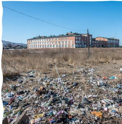
Picture 4. Garbage in the city

In Zabaikalsky Krai (Chita is administrative centre), there are some actively working environmental non-governmental organizations (NGOs). They are Public ecological charitable Fund "Baikal", TRANS-Baikal regional Department of public organization "Russian ecological Academy", Ecological center "Dauria", Chita centre