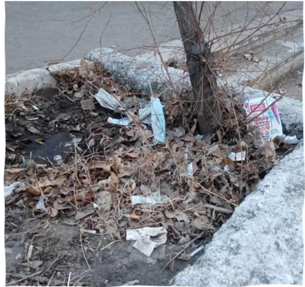
Picture 6. Masks are everywhere

For the sake of interest, I decided to see what a medical mask consists of. The masks contain plastic. This means that the mask can be melted and used for creating new things. There are some activist groups in the country, they recycle old materials, make new items and sell them. After all, not every person has an oven that heats up to 500 degrees. So I offer my idea.